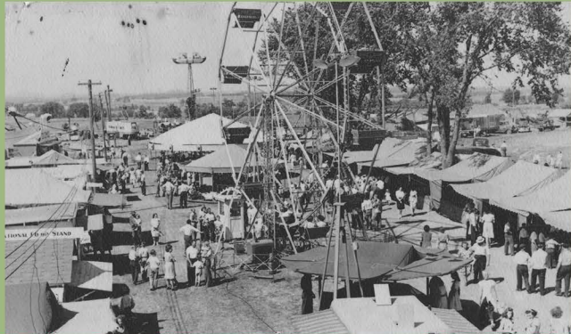
Clark County Fair - The Midway Circa 1930s