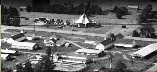
Clark County Fairgrounds 1980

Proud of our Past and Looking Forward to the Future