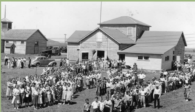
1938 Clark County Calf Club Members in front of the 4-H Hall