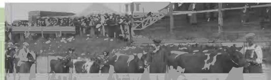
c.1920 - Stock Show of Animals after all Judging was complete -Clark County Fairground(old Grandstand)

These planned additions or upgrades address the current issues and needs of the Fairground and its users and should help attract new events and opportunities to Clark County. Our goal is to provide a viable and functional Fairgrounds and Event Center property that meets the needs of the next generation of Clark County residents, and beyond.