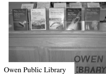
Owen Public Library