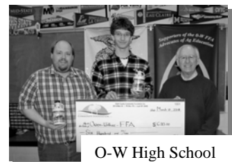
O-W High School