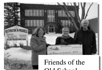
Friends of the Old School