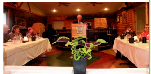
April 6, 2017 CCCF Annual Meeting Parkway Pines, Greenwood, WI