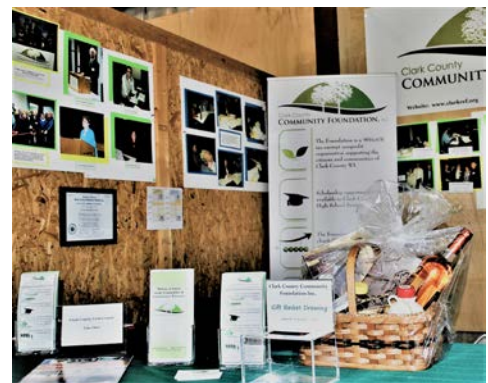
CCCF Fair Booth – August 2017 – Clark County Fairgrounds – Neillsville