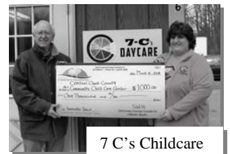
7 C's Childcare